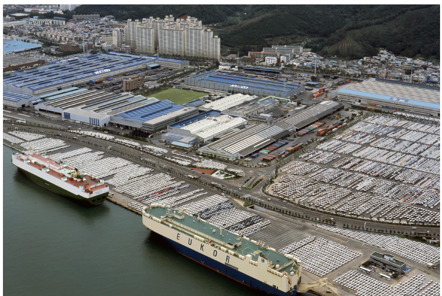
The Hyundai Motor factory in Ulsan is the largest in the world

Fulbright University Vietnam University of Ulsan Yeungnam University Dean of the School of Social Sciences, University of Ulsan University of Ulsan University of Ulsan Busan IT Promotion Agency University of Ulsan Ulsan Development Institute Hanbat National University Ulsan Development Institute President of University of Ulsan Hannam University Mayor of Ulsan Metropolitan City University of Ulsan