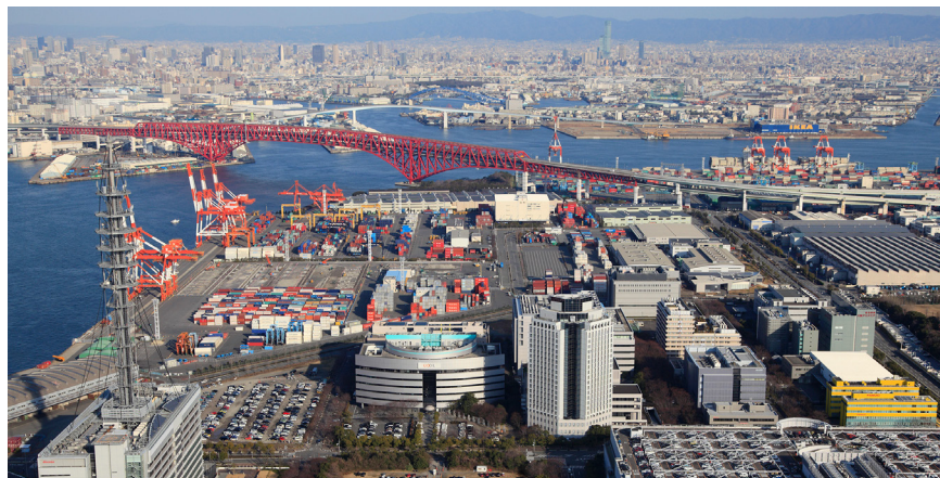
The majority of Osaka Bay area is built on reclaimed land

Director of Urban Research Plaza, Osaka City University Kwansei Gakuin University Setsunan University Ryukoku University Deputy Mayor of Sakai City Saitama University Vice President of Osaka City University Osaka City University Fukuoka University Chief Administrative Officer, Osaka City University Kwansei Gakuin University Mayor of Minato Ward, Osaka City Mayor of Kita Ward, Osaka City Former Director of Port & Harbor Bureau, Osaka City Ryukoku University