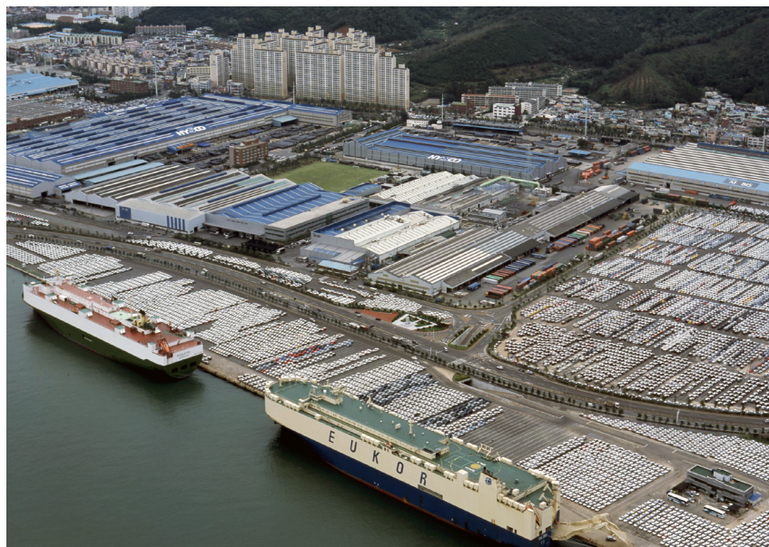
The Hyundai Motor factory in Ulsan is the largest in the world

Fulbright University Vietnam University of Ulsan Yeungnam University Dean of the School of Social Sciences, University of Ulsan University of Ulsan University of Ulsan Busan IT Promotion Agency University of Ulsan Ulsan Development Institute Hanbat National University Ulsan Development Institute President of University of Ulsan Hannam University Mayor of Ulsan Metropolitan City University of Ulsan